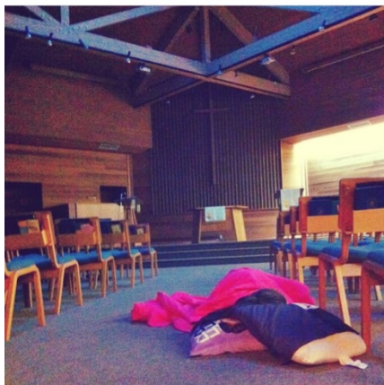
Figure 1: I took this photo of a student who fell asleep in the sanctuary during a youth event. I felt it captured the interaction between real life and our Judeo Christian context.

I have been inspired to write this paper by my ever growing love for my iPhone and my constant use of the Instagram application. I will seek to argue reasoning for and against this paper’s thesis. I hope to provide commentary that will coax anyone to believe that if one has an iPhone, she can use it to create art. Instagram offers an individual the ability to share her captured moments with the world in real time. Her shared photo is Instagram’s version of the tweet 1 or the status update 2 . Photos are taken and shared with the internet world as they occur in the real world. A person is able to engage her culture and tradition in the here and now with those who cannot be with her in the present. This process allows her to become what T.S. Eliot refers to as a more whole person. Eliot believed in “A continual extinction of personality.” That is to say that the personality of someone engaging with her culture will no longer be defined as her personality alone, but instead a learned persona shaped by the blending of herself, her culture and her tradition. “His