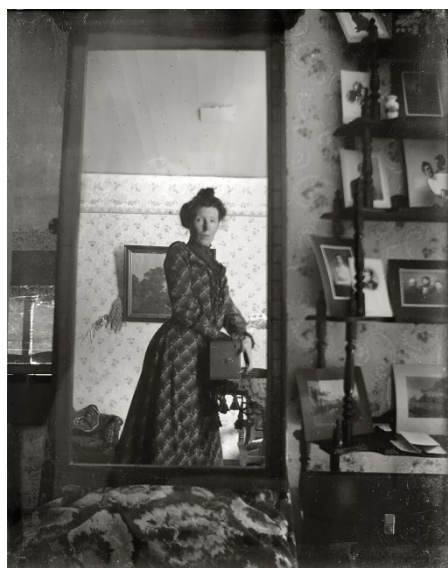
Figure 6: "World's First Selfie" Edwardian woman in 1900 with a Kodak Brownie box camera.

Regardless of Sircello's thoughts, Bell stands on his own two feet when he ensures us that human emotion is enough to make a photo art. But what if that emotion is completely self-centered? What if the artist is using her iPhone to share photos that are strictly about self-