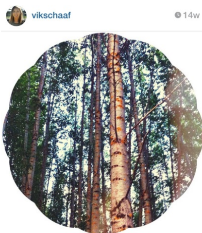
Figure 2: A photo I took in Minto Brown Park of nature revealing herself to me. The trees are orange!

Eliot says that to engage with one’s tradition is to become a whole person as a result of the impression a tradition and culture leaves on the individual. When an artist takes a photo with her iPhone, she is engaging her culture in several ways. First, her camera is a modern object. A cell phone is not designed to be a primarily a camera, but the installation of applications on the phone have made it possible for the camera to be used with the intent of sharing images captured. This is a method of engaging her culture. Second, she is sharing her photography with the world